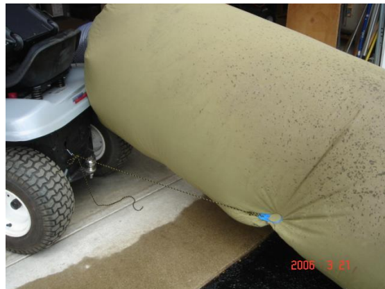
Fig 4- Leaf Bag in use and towrope carrying the weight of the leaf bag.