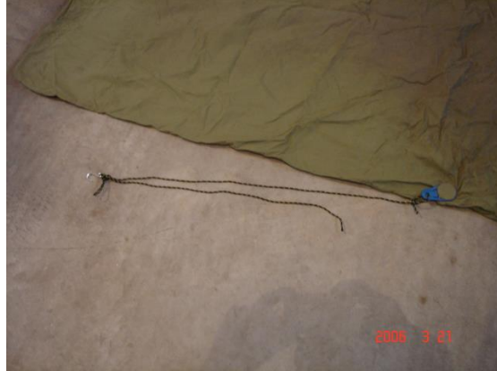
Fig 2- Bag clip attached half way down side of bag. Towrope is about a foot short of end. (Your clip may vary.)