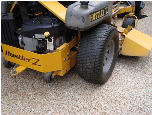
Tire sticks out past the fender/gas tank.

The ZTM does not have a fender covering the rear wheels. The end of the discharge tube is normally secured to the rear fender, (see instruction photo #1 on page 7). Therefore a bracket will be needed to support the end of the discharge tube. The bracket can be as simple as a broomstick, zip tied or taped to the rear of the frame. The bracket must be long enough to extend past the rear tire and support the discharge tube, but should not stick out much further than needed. The bracket can support the tube from below or above and is secured to the bracket using one of the rope ratchets.