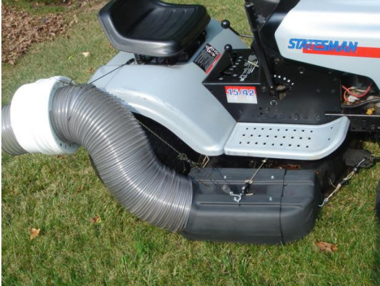
Fig 1- Discharge Tube attached to side of lawn tractor at top, and from DA to Chute Vent Disk.