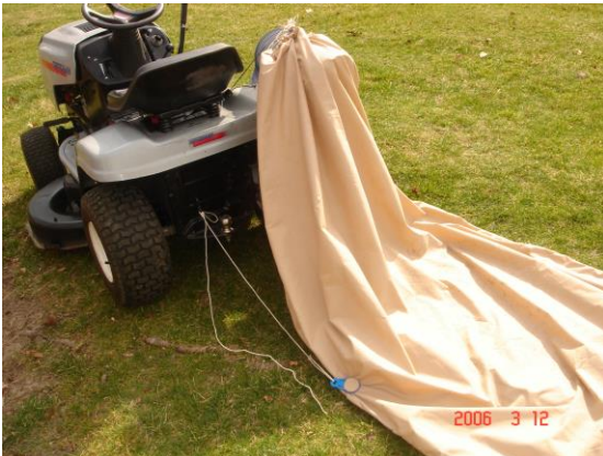
Fig 3- Leaf Bag and towrope attached to the tractor. Note bag clip is on side of bag, in line behind tractor.