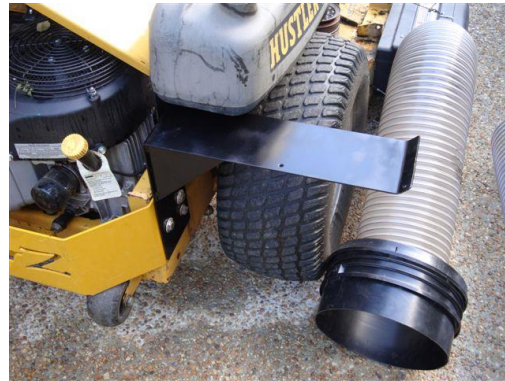
Fancy bracket installed to support discharge tube.

Complete the installation of the DAK using the rest of the instructions. If you have any questions please give us a call or email. 877-530-9084. Ken@LawnTractorLeafBag.com